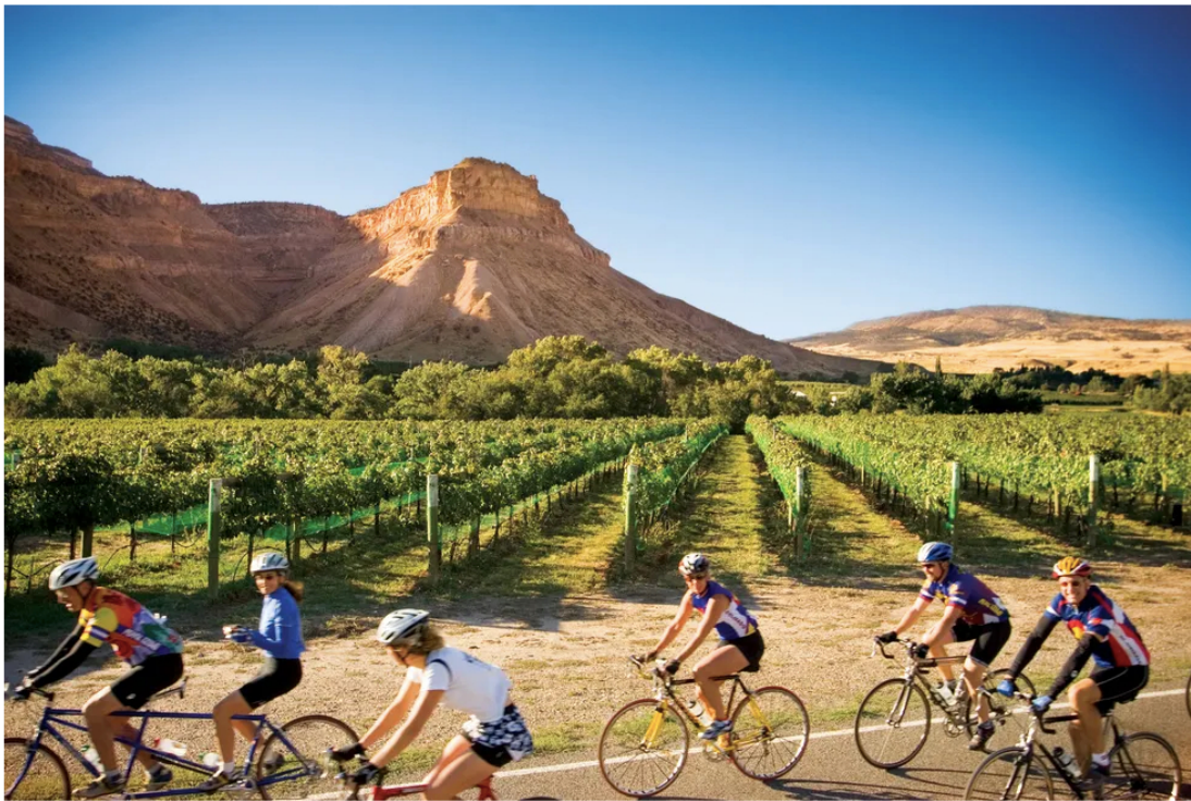
Pedal away your wine calories on the roads of Grand Junction, Colorado.

Why its wines are worth your time: Often we think of Colorado for skiing, hiking and outdoor experiences, but there's an exciting wine culture there waiting to be discovered. Shaded by red rock cliffs, Grand Junction and the area outlying Colorado's Grand Valley is home to nearly 30 wineries and vineyards .