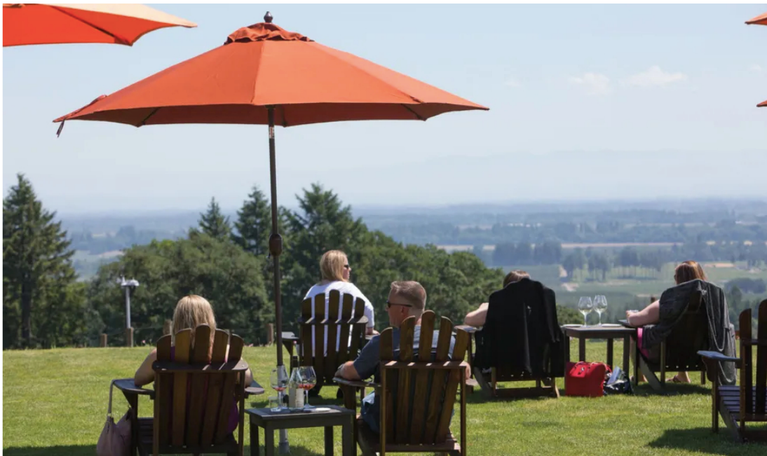
Expect expansive views and delicious wines at in Willamette Valley, Oregon.

Why its wines are worth your time: A 45-minute drive from Portland, the Willamette Valley, best known for producing premier Pinot Noir , is Oregon's leading wine region , boasting over 670 wineries. As visitors begin revisiting the region to experience the wine culture, businesses have adapted their experiences to be outdoor and socially distanced.