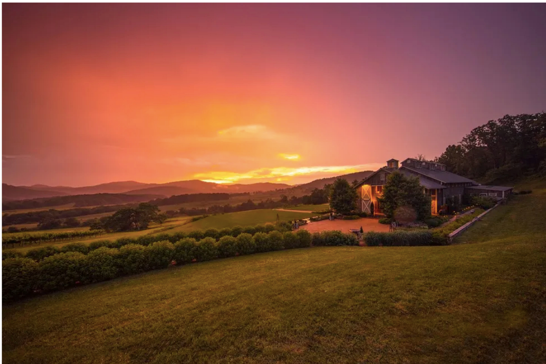
Pippin Hill Farm & Vineyards is far more than just a winery. It's a cohesive agricultural destination incorporating vineyards, a farm, an expansive kitchen, plus gardens managed by an onsite horticulturist. Visit Charlottesville